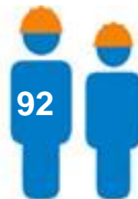
Health & Safety Standards & Procedures