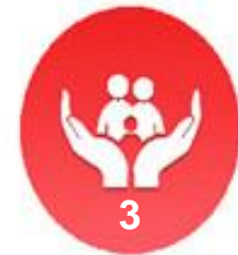
Health & Wellbeing