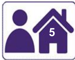
Landlord Tenant Relationship