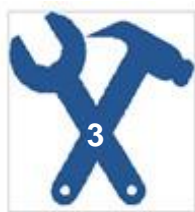
Repairs & Maintenance

The graphics below shows a breakdown of the total number of mandatory recommendations identified under each section of the Code.