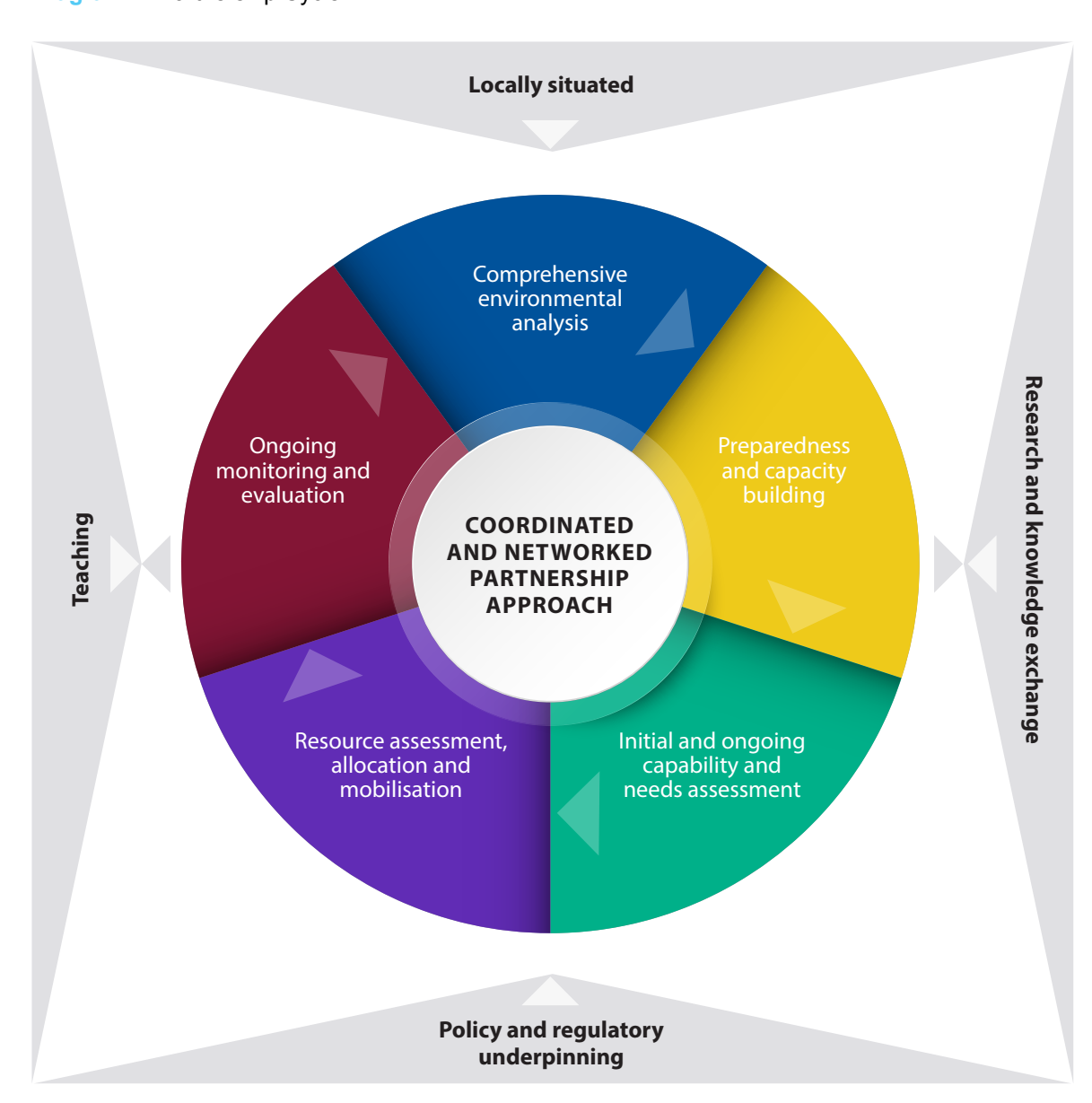
Diagram 1: Partnership Cycle

That said, the framework has been developed to ensure that institutions, partnerships, and the sector consider the full cycle of engagement in any humanitarian response. It has been designed to have relevance and applicability at the university, partnership, and sector level.