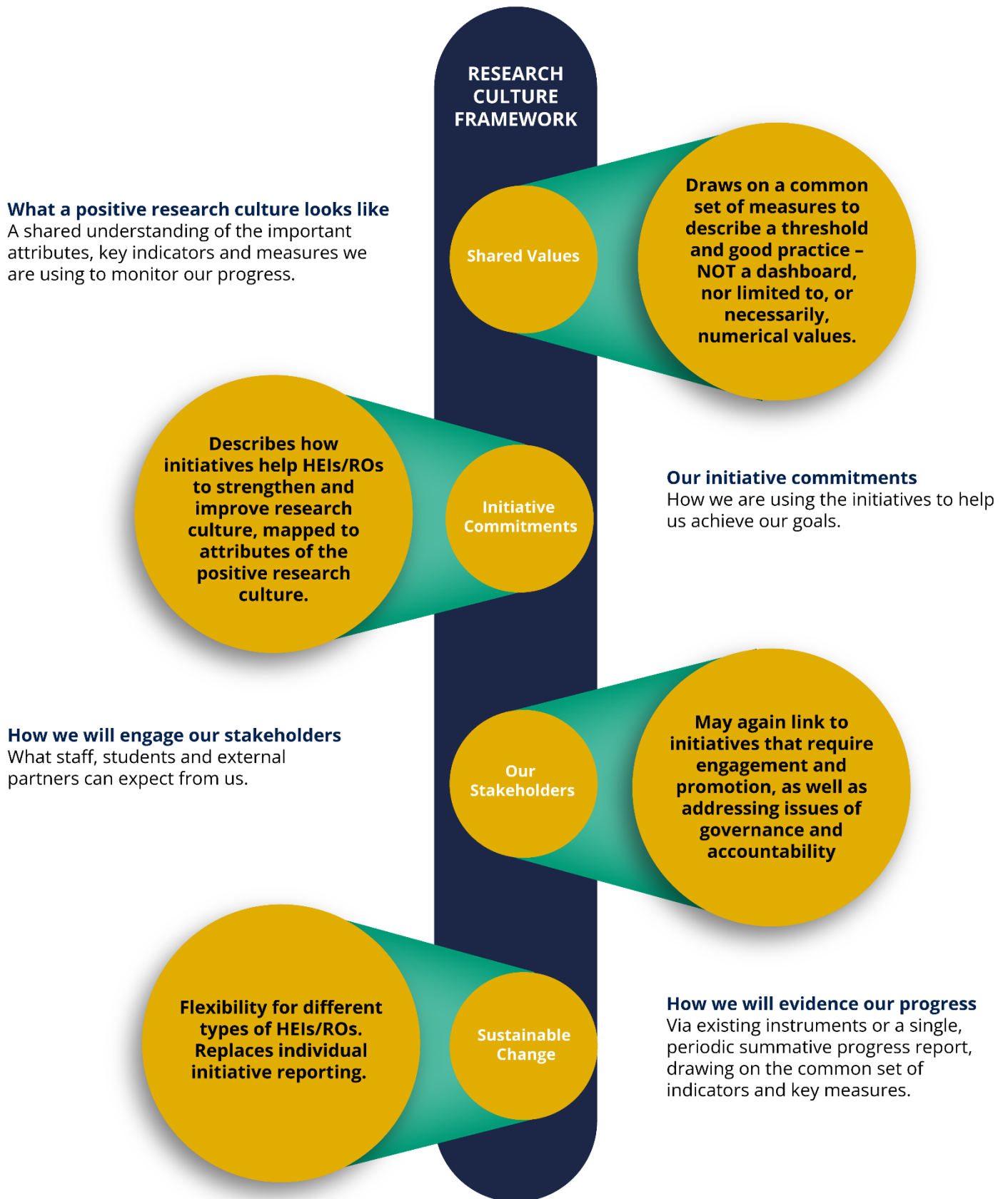
Figure 2 Illustrative example of a high-level strategy for enhancing research culture based around the shared principles and values.